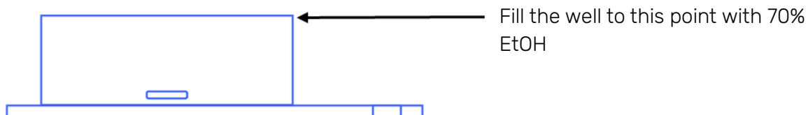
Figure 2: Side view diagram of CorePlate™ 1W-3D showing the fill level of the well.

EtOH sterilization may also be done in combination with UV-light sterilization.