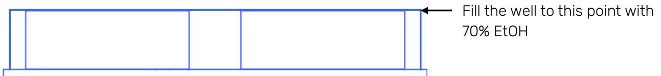
Figure 2: Side view diagram of CorePlate™ 6W-3D showing the fill level of the wells.

EtOH sterilization may also be done in combination with UV-light sterilization.