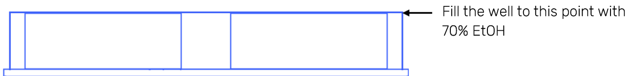
Figure 2: Side view diagram of CorePlate™ 6W-3D showing the fill level of the wells.

EtOH sterilization may also be done in combination with UV-light sterilization.